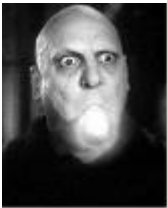
innovation: self-powered lighting

http://www.arrl.org/hamfests.html#listing