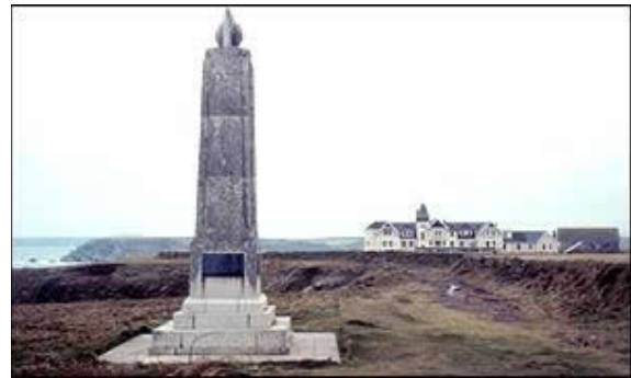
Marconi Memorial- Poldhu Cornwall, UK

passport and funds to jump across the pond, you can go to the memorial online. And with the pictures and information available at http://www.radiomarconi.com/marconi/memorial.html , You'll be glad you stopped in. Here's just one of the many pictures from the website: