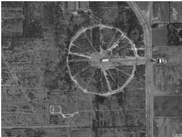
What is this? (LORAN C station, Ovid, NY)

http://www.navcen.uscg.gov/Loran/default.htm